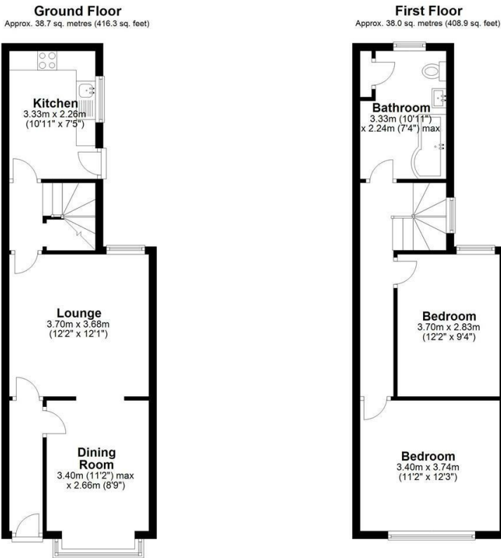
Total area: approx. 76.7 sq. metres (825.2 sq. feet)

Agents Note: Whilst every care has been taken to prepare these sales particulars, they are for guidance purposes only. All measurements are approximate and are for general guidance purposes only and whilst every care has been taken to ensure their accuracy, they should not be relied upon and potential buyers are advised to recheck the measurements